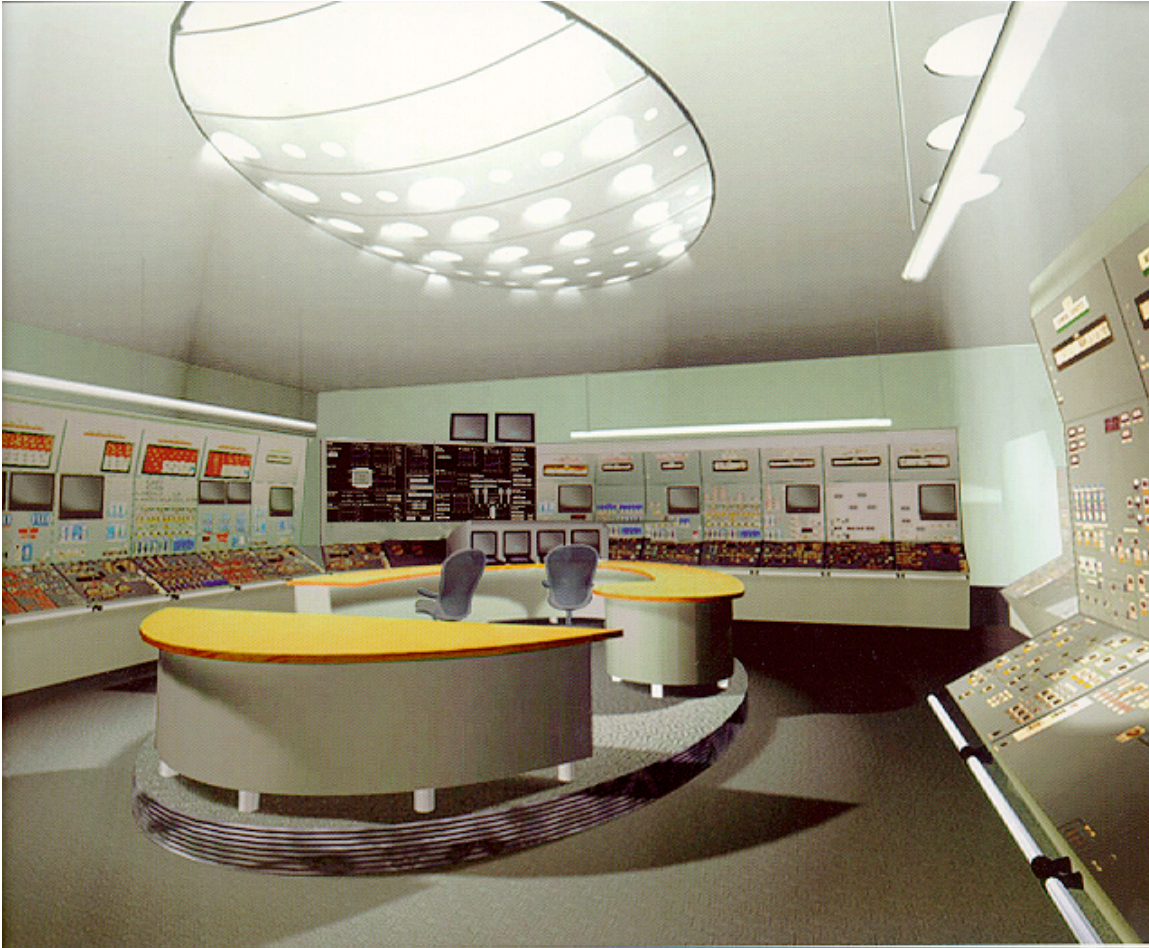
Figure 5: CANDU Advanced Control Centre

A major evolutionary change from previous CANDUs is the separation of the Control and Display/Annunciation features formerly provided by the digital control computers. The CANDU 9 plant monitoring, annunciation, and control functions are implemented in two evolutionary systems: the Distributed Control System (DCS) and the Plant Display System (PDS). The DCS implements most of the plant control functions on a single hardware platform while PDS similarly implements the main control room display and annunciation functions. This permits extensive control, display or annunciation enhancements within an open architecture, providing great flexibility.