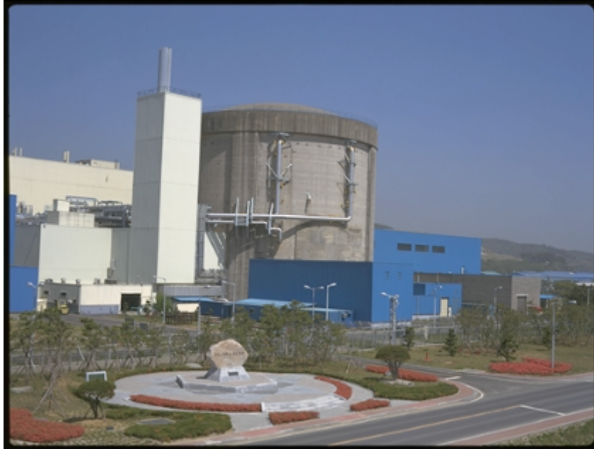
Figure 3: Wolsong Unit-4, Republic of Korea

The CANDU 6 design has evolved continuously over the years since the original four units (Pt. Lepreau and Gentilly-2 in Canada, Embalse in Argentina, and Wolsong-1 in Korea) went into service in 1983 and 1984. The most recent units entering service in 1996 - 99 include Wolsong 2, 3, and 4, and Cernavoda in Romania. Units are also under construction at Qinshan, Zhejiang Province, in the People's Republic of China. Figure 3 shows Unit-4 at Wolsong.