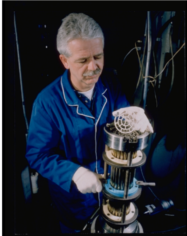
Figure 2: CANDU Fuel Bundle

thickness is another prime example of the influence of the CANDU design pioneers on the project. The early designers were determined to minimize the non-fuel materials within the reactor core that waste neutrons and thereby limit the total heat output from the fuel. The goal was a fuel irradiation of 240 MWh/kg, which would result in an attractively low fueling cost for commercial reactors. Early experiments of thin fuel sheaths performed well and ever since all CANDU fuel has been sheathed with 0.4mm thick Zircaloy tubing, which has achieved an outstanding low defect rate.